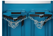
ADJUSTABLE CYLINDER BRACKETS SECURE A WIDE RANGE OF CYLINDERS