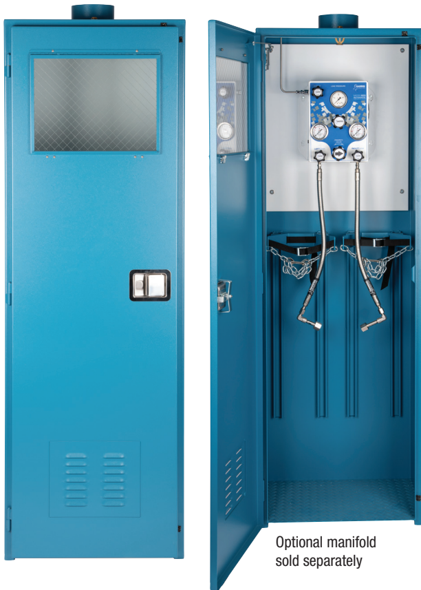
Optional manifold sold separately

These cabinets can be fitted with manifolds, or the Harris EZ regulator mounting or other gas controls so that both the cylinder and the control system are enclosed. The cabinet has the capacity to allow 150–200 linear feet per minute of air to pass across the open window face to ensure that workers are not exposed.