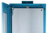
REMOVABLE BACK PANEL ENABLES THE MOUNTING OF GAS DELIVERY SYSTEMS AND COMPONENTS