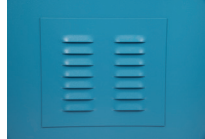
LOUVERED DOOR PANEL TO PROVIDE POSITIVE AIR FLOW