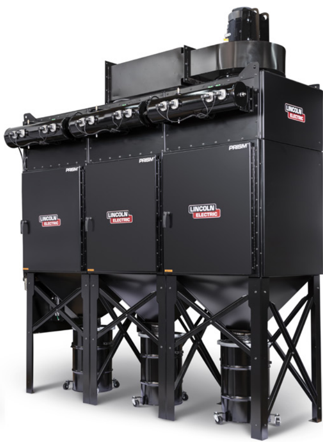
Shown: Prism 4, 8 &12 L17587-4, L17587-1, L17587-3