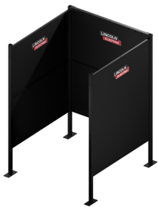
Standalone (Side-by-Side Starter)

K5737-2 Weld Booth 5 ft. (1.5 m) Side-by-Side Add-On K5737-4 Weld Booth 5 ft. (1.5 m) Back-to-Back Add-On