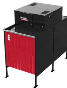
Back-to-Back Standalone (Back-to-Back Starter)