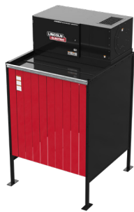
Standalone (Side-by-Side Starter)