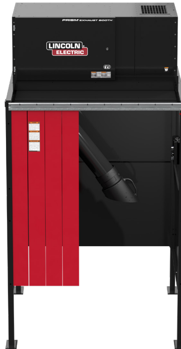
Shown: Prism® Exhaust Booth Standalone (Side-by-Side Starter), K5664-1

Create an Effective and Efficient Space for Teaching