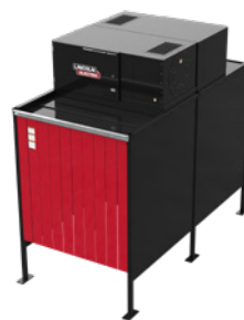
Back-to-Back Standalone (Back-to-Back Starter)