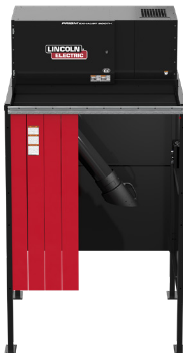
Shown: Prism® Exhaust Booth Standalone (Side-by-Side Starter), K5664-1

Create an Effective and Efficient Space for Teaching