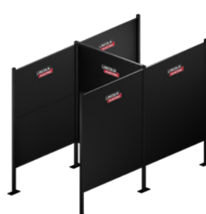
Back-to-Back Standalone (Back-to-Back Starter)