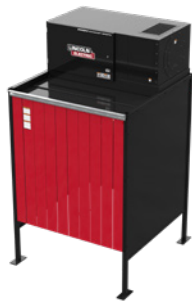
Standalone (Side-by-Side Starter)