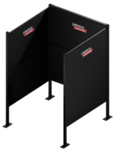
Standalone (Side-by-Side Starter)

K5737-2 Weld Booth 5 ft. (1.5 m) Side-by-Side Add-On K5737-4 Weld Booth 5 ft. (1.5 m) Back-to-Back Add-On