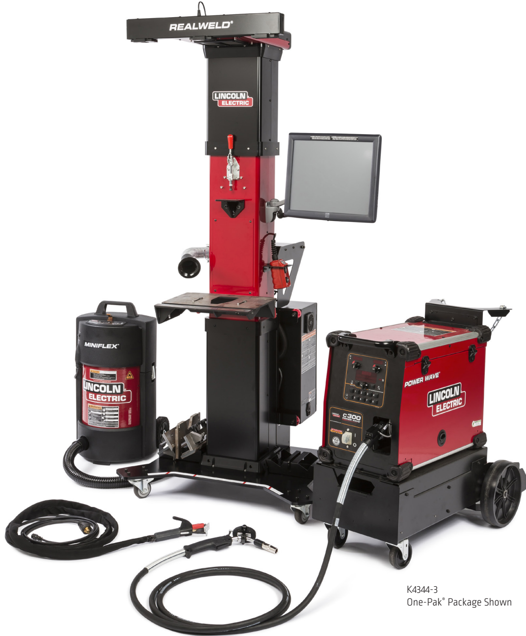
K4344-3 One-Pak® Package Shown