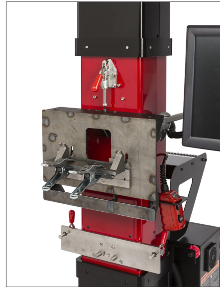
Table Position 2 Position: Overhead