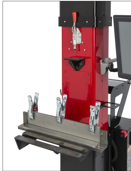
Table Position 1 Position: Horizontal