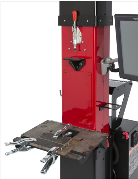
Table Position 1 Position: Flat

REALWELD Trainer teaches multiple welding processes in a number of welding positions (1F, 2F, 3F, 4F, 1G, 2G, 3G) and joints (lap, tee, groove, flat plate).