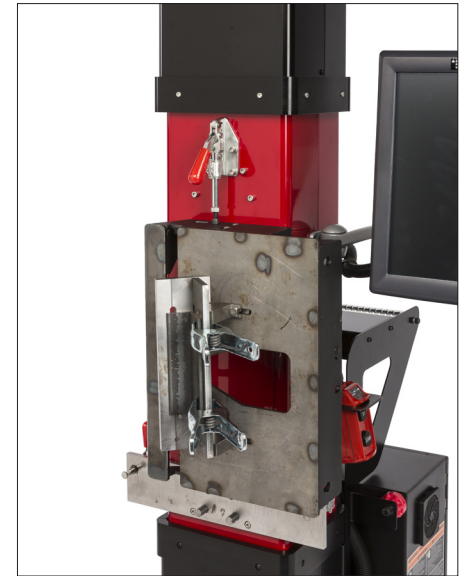
Table Position 3 Position: Vertical