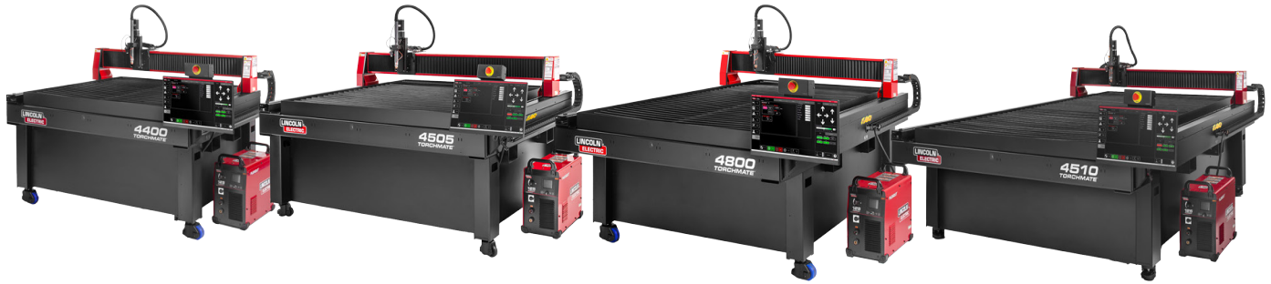
Torchmate 4400 | 4505 | 4800 | 4510