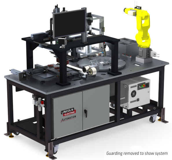
Guarding removed to show system

The Lincoln Electric Automation Pad Print Pro+™ system synchronizes pre-treatment, artwork application, cure, and inspection. Working within the constraints of an injection molding cycle, the system automates these processes for a wide range of materials to help reduce manufacturing costs. Let's explore the benefits of the Pad Print Pro+ systems!