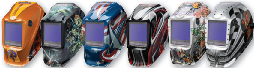
Terracuda* K3039-4 Zombie™ K4158-4 3350 All American* K3175-4 Twisted Metal™ K3248-4 Hot Rodders™ K4440-4 Motorhead™ K3100-4