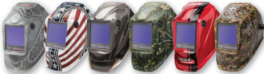
Medieval™ K4671-4 Daredevil™ K3683-4 Foose Imposter™ K4181-4 White Tail Camo™ K4412-4 Code Red® K4034-4 Born To Weld™ K3616-4