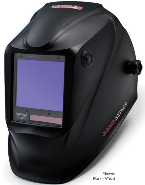
Shown: Black K3034-4