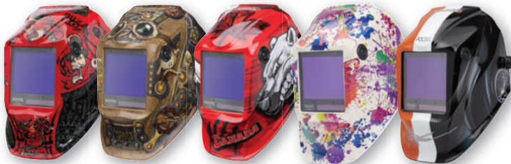
Mojo* K3101-4 Steampunk™ K3428-4 Polar Arc* K3255-4 Creative Spark™ K5134-4 Foose Monarch* K5133-4