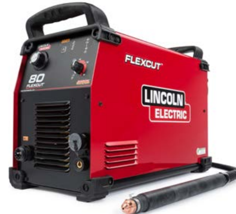
K4809-1 FlexCut 80 with BK12849-25 LC100M Machine Plasma Torch