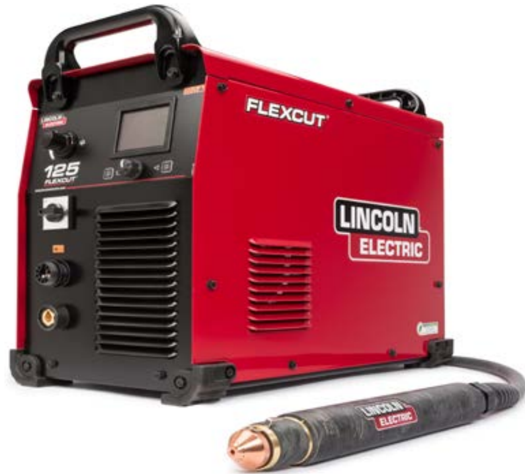
K4811-1 FlexCut 125 Base Model (w/o Torch) BK4300-4 LC125M Machine Plasma Torch (Torch Sold Separately)