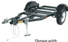
Shown with optional K2639-1 Fender & Light Kit

LPG Tank Holder Holds LPG tank. Compatible with the following undercarriages: K1770-2 and -3, K1737-3 and -4. Order K1745-2