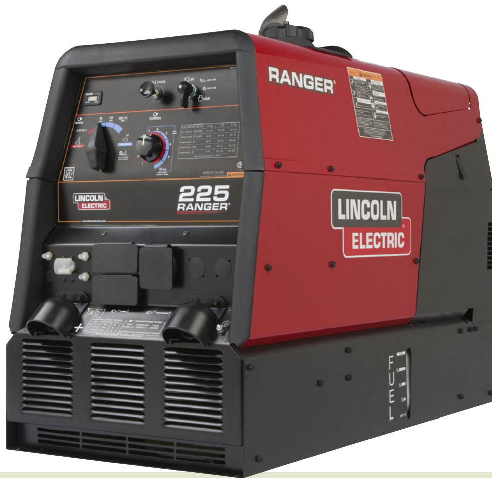
Shown: Ranger 225 (K2857-1)