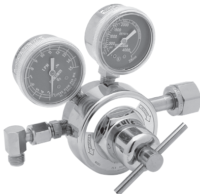
Medical Metering Regulator