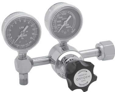
Medical Metering Regulator