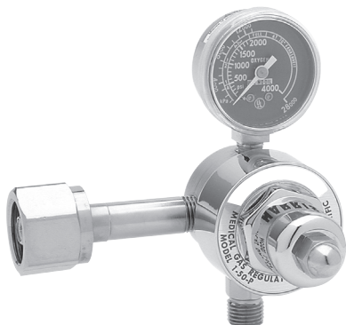
Medical Single-Stage Preset Regulator