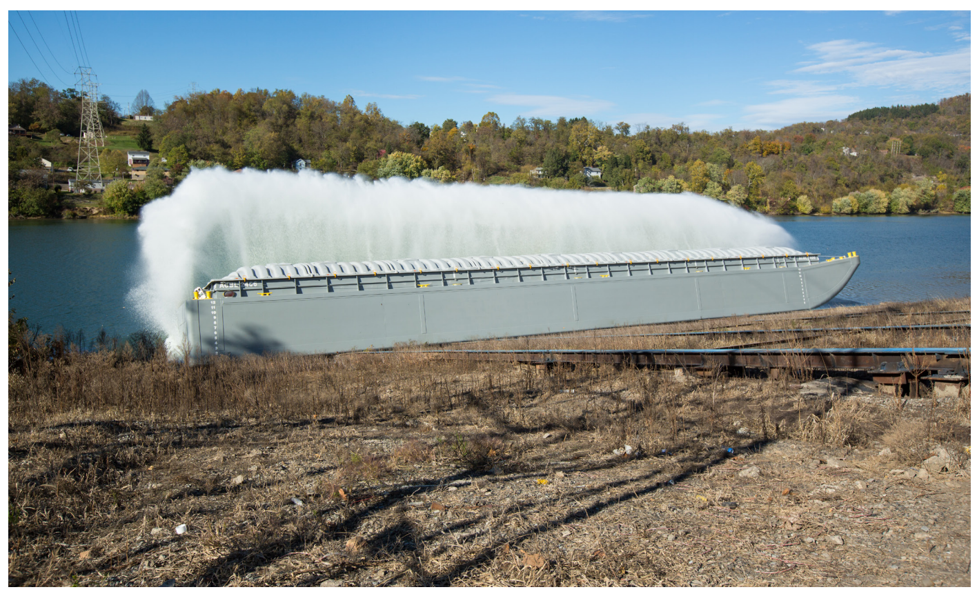
On average, Brownsville Marine Products launches a new barge every two days.

At Brownsville Marine Products (BMP), situated on the banks of Pennsylvania's Monongahela River, a new barge hits the water every two days. This quick production schedule can't hold up to productivity losses or quality issues.