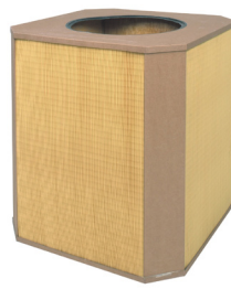
Mobiflex® 200-M Filter

Some models include a clear halogen lamp and automatic start/stop feature. With the use of an arc sensor, the system automatically starts and stops the fan unit, providing hands-free operation and energy conservation. All this combined provides a highly effective system with maximum efficiency and minimal disruption to welder productivity.