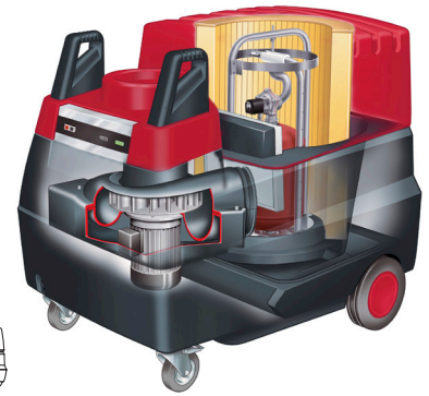
Internal view of Mobiflex® 400-MS showing RotaPulse® self-cleaning filter mechanism.