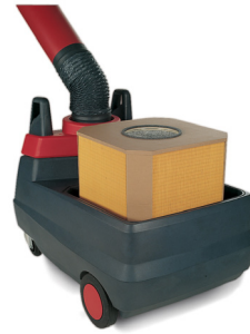
Filter shown inside Mobiflex® 200-M (cover removed)