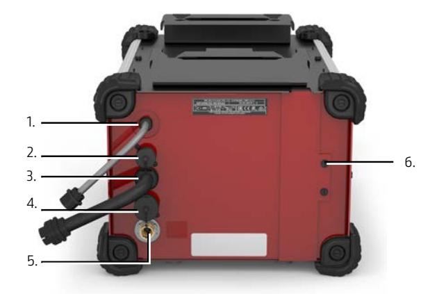
NOTE: For operation with the K2823-3 Power Wave S350 power source or K2862-3 Power Wave S350 Ready-Pak* models with code numbers prior to 11600, the S28481 retrofit kit is required. Contact the customer service team in Cleveland, Ohio to order a kit at no charge to assure proper connection to the Advanced Module.