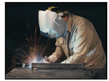
Conventional CV short circuit transfer using carbon dioxide (CO.) and 0.045 in. solid wire.

For more information see Nextweld® Document NX-220