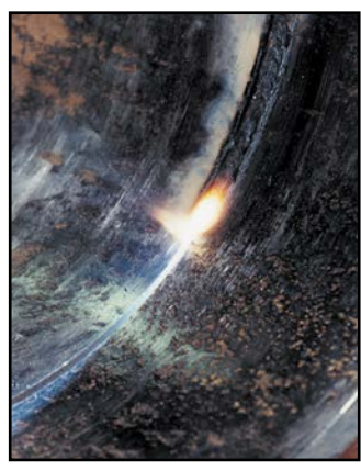
Inside of an 8 in. x 0.375 in. wall API 5L-X52 pipe, welded in 5G position