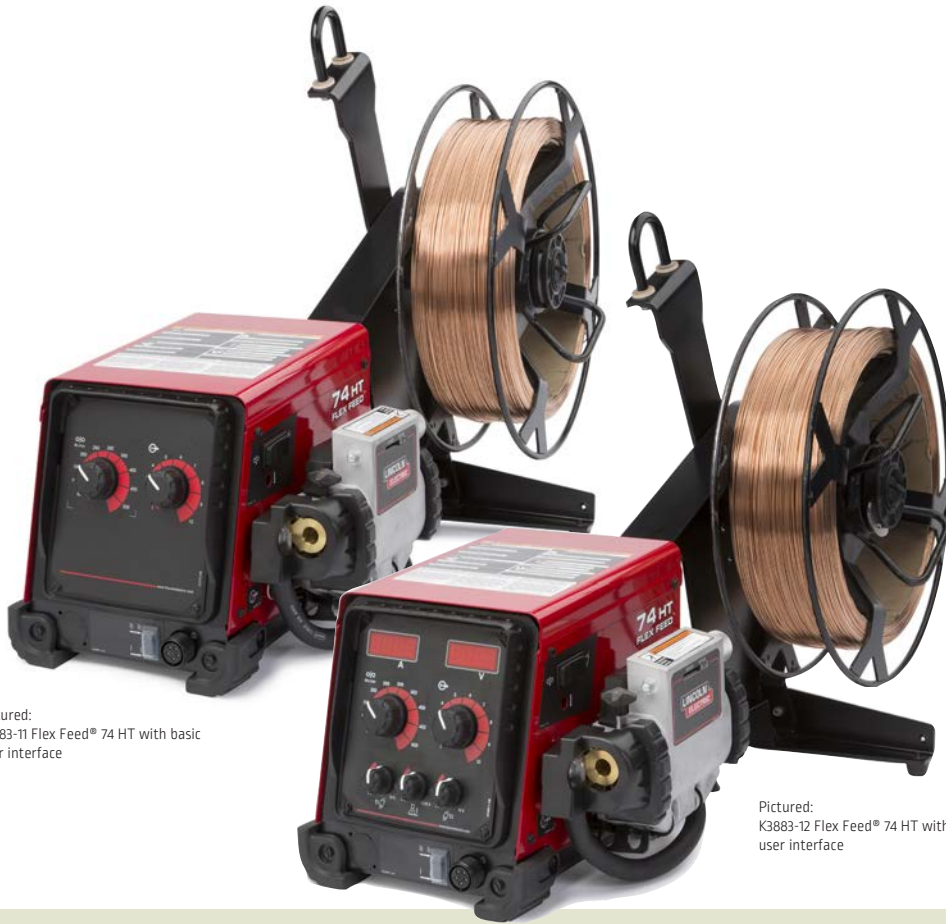
Pictured: K3883-11 Flex Feed® 74 HT with basic user interface