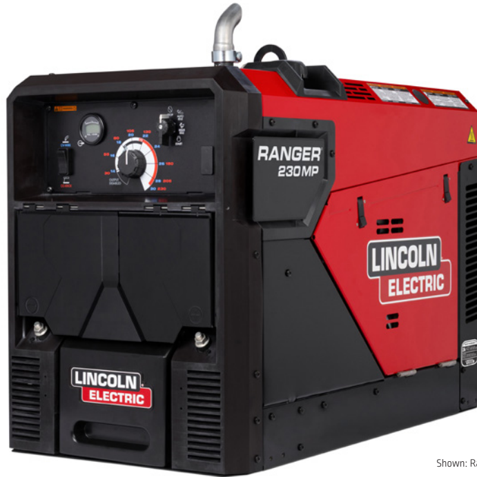
Shown: Ranger 230MP (K5938-1)