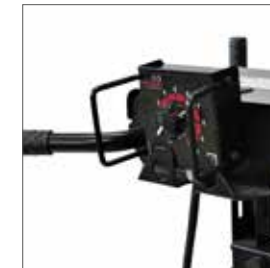
Remote control holder