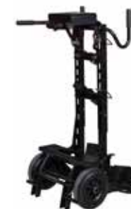
CART 24 K14191-1