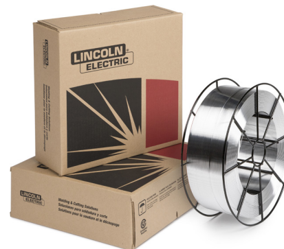
16 lb steel spool