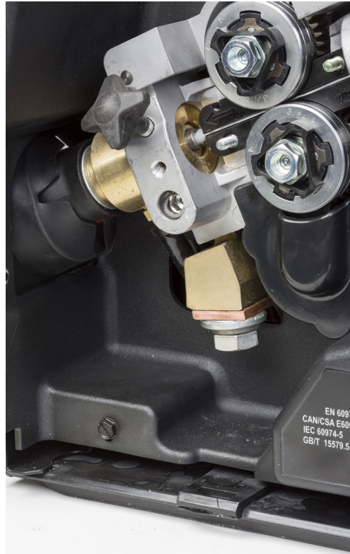
Wire shavings during the feeding process with standard aluminum wire versus SuperGlaze HD