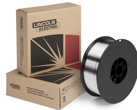
20 lb plastic spool