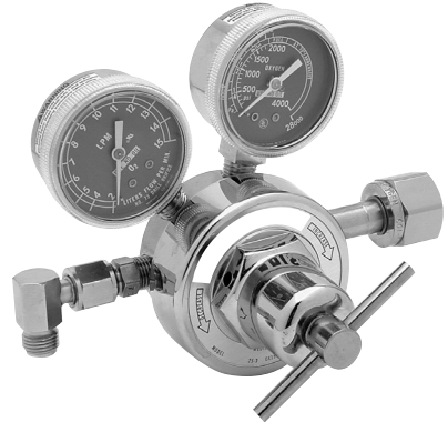
Medical Metering Regulator