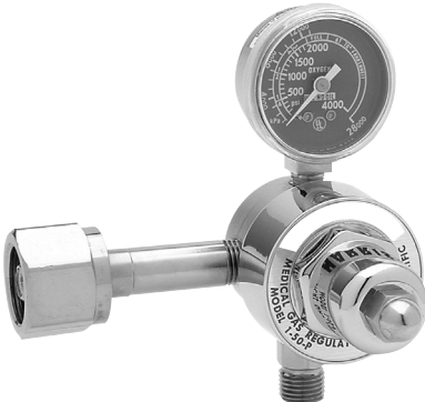
Medical Single-Stage Preset Regulator