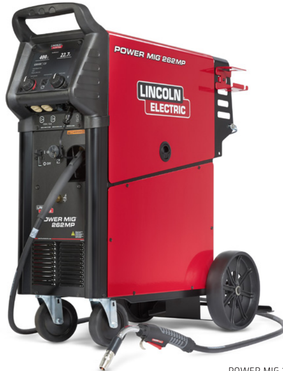
Shown: POWER MIG 262MP, K5376-1