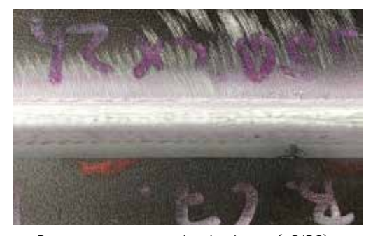
Dye - penetrant examination image (2G/PC)

Nyloid 2 produces excellent weld bead with smooth surface and porosity free.