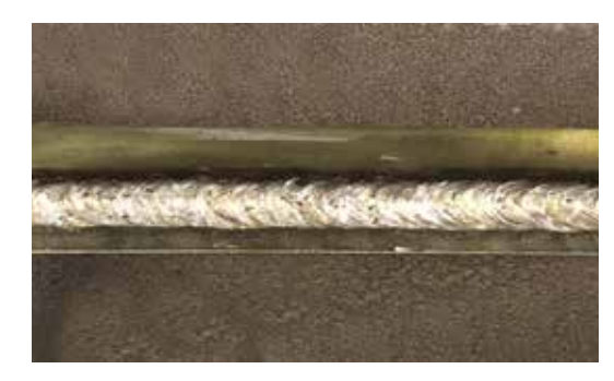
Weld bead profile (2G/PC)

In addition Sahara Ready Pack (SRP®) ensuring the best product integrity, eliminates the need of re-drying before use, reduces wastes on site and simplify welding control operations.