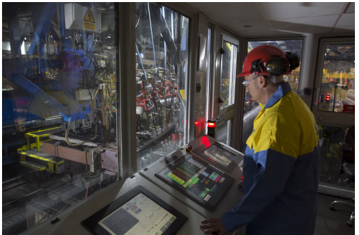
(1) A view of the Tata outer diameter welding operations. (2) The entire process is monitored from a centralized control room.