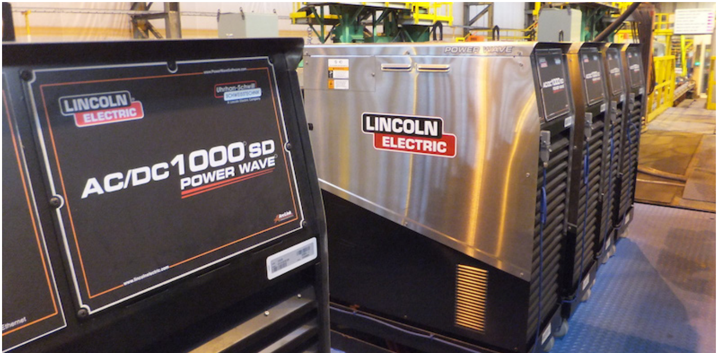
The Power Wave® AC/DC 1000 SD advanced process welding power source produces software-driven AC, DC positive or DC negative output, allowing Tata to control the deposition rate and penetration. The result over conventional power sources is increased weld speeds, consistently higher quality welds and improved efficiencies in a single or multi-arc environment.

For proactive quality assurance during welding, the Z5 system continuously records all welding parameters, including travel speed, welding currents, voltages, wire-feed speeds and wire-feed motor torques. The system automatically generates pipe reports for each weld produced. These contain all mechanical, electrical and welding setup parameters for the entire welding process. If any deviation from tolerances is detected, the Z5 system notes the corresponding pipe position, making it easy to locate potential indications.