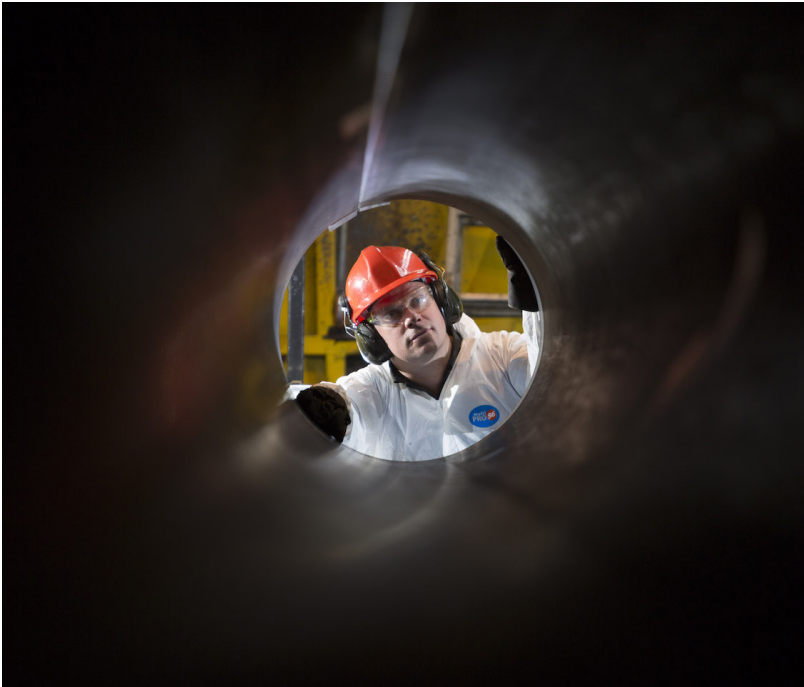
A Tata associate visually inspects the inner diameter of the pipe.