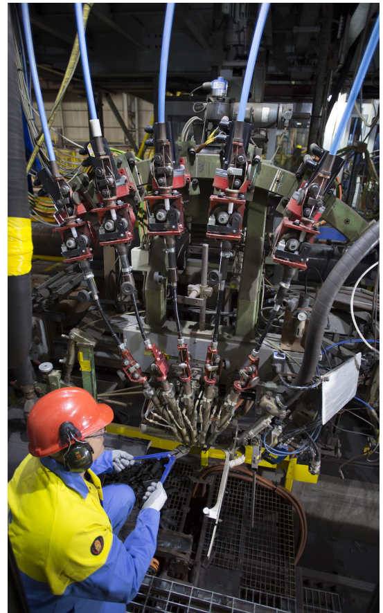
Preparing to perform another multi-arc weld.

"The Power Wave 1000 AC/DC SD is the only proven inverter used in multiple-arc SAW applications," says Elmar Schwill, chief engineer at Uhrhan & Schwill. "Combining it with our Z5 gives Tata the ultimate flexibility, enabling it to produce at the highest output rates with exceptional prime rates (prime pipe is pipe produced with zero indications – meaning it meets all quality requirements in line). Tata has always been at the forefront of pipe production expertise, and this upgrade reinforces this position."