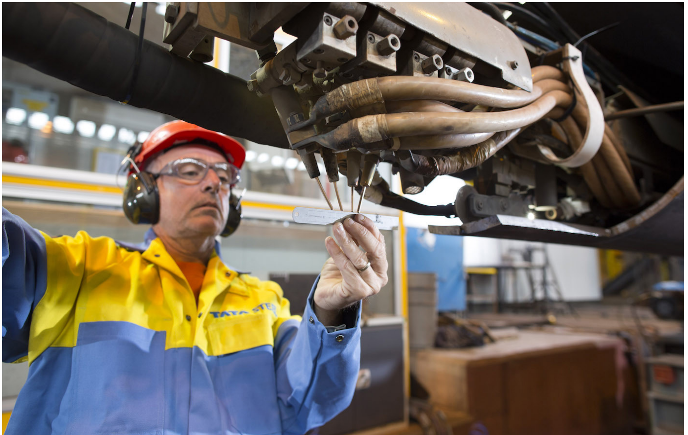
A Tata Steel operator confirms the correct lead to trail arc distance.