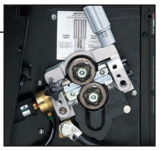
Professional Heavy Duty MAXTRAC® Wire Drive System