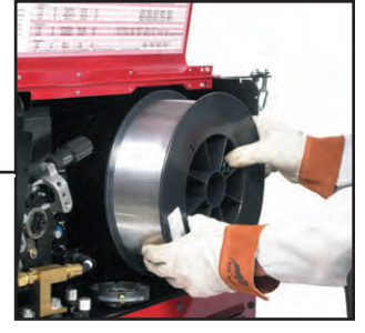
Easy-Load Wire Compartment