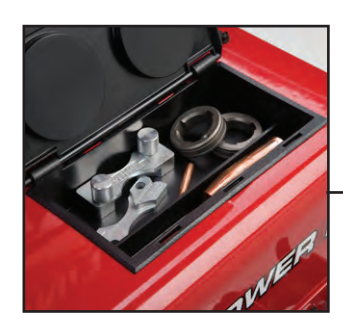
Gun and Drive Expendable Parts Compartment