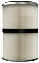
KP5178-1 FILTER, MERV 11, POLYESTER Recommended for Steel Welding Applications