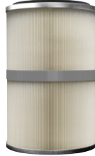
KP5178-4 FILTER MERV 11 Oil Resistant Recommended for Oil Resistant / Welding on Stamped Parts