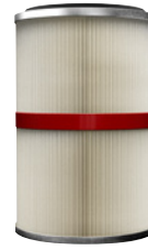
KP5178-3 FILTER, MERV 16, PTFE Recommended primarily for cutting applications, and for some heavy fume welding