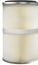
KP5178-2 FILTER, MERV 16, Cellulose/Nano Recommended for Steel, Stainless Steel, and Galvanized Welding Applications