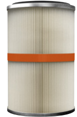
KP5178-5 FILTER MERV 16 Oil Resistant recommended for oil resistance, for welding on steel, stainless steel and galvanized stamped parts