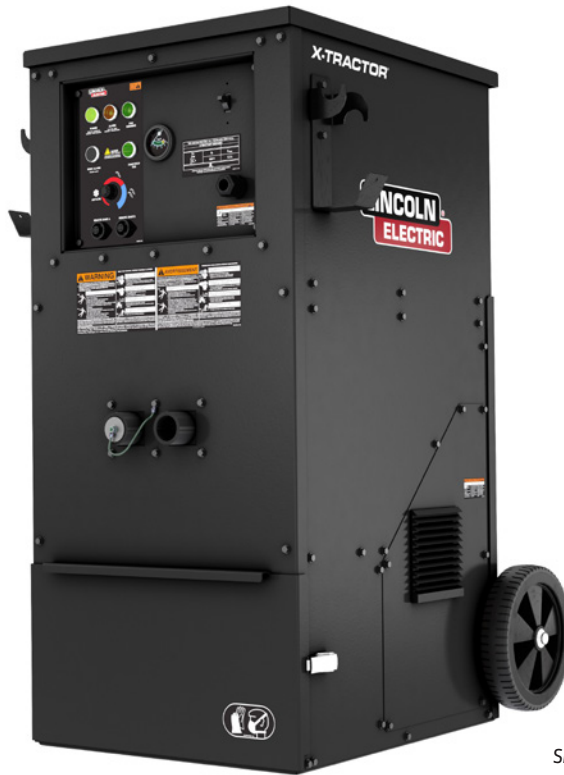
Shown: X-Tractor 2 Fume Gun K5271-1