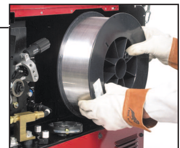
Easy Load Wire Compartment