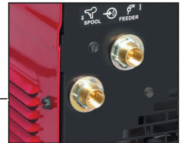
Additional Gas Solenoid – Controls Gas Flow to a Spool Gun