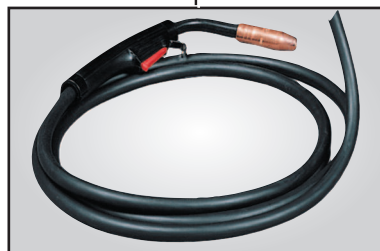
Extra-Length 15 ft. (4.5 m) Gun

Adds 4-step trigger interlock, spot mode, adjustable run-in speed for smoother arc starting, and adjustable burnback time to minimize wire sticking in puddle.