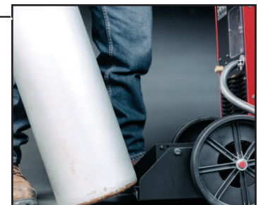
Easy Load Gas Cylinder Platform