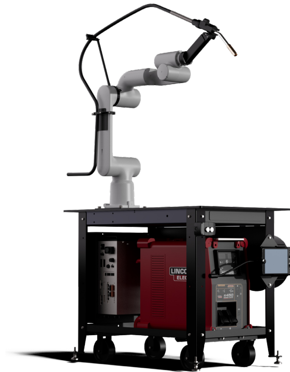
ClassMate GoFa Welding Cobot