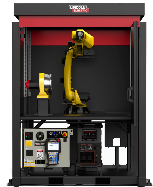
ClassMate Pro System with Positioner