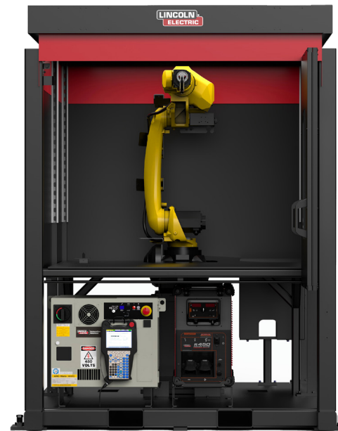
ClassMate Pro System