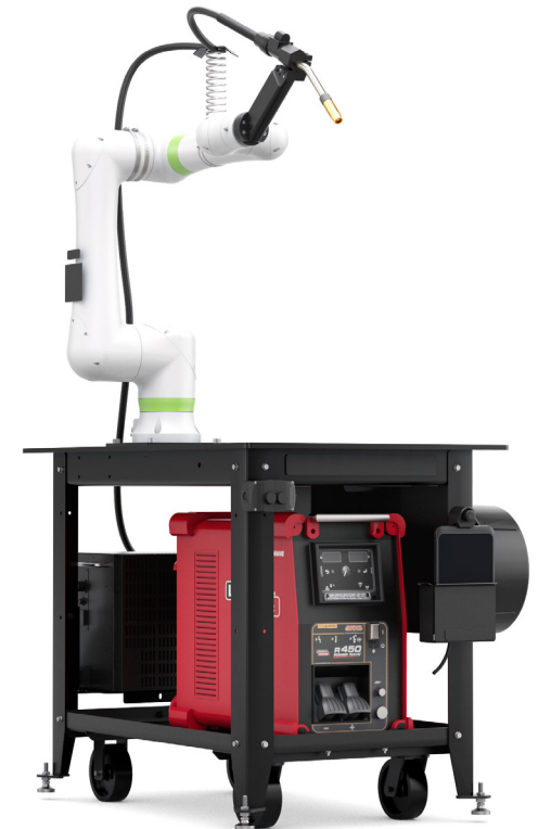
ClassMate CRX Welding Cobot