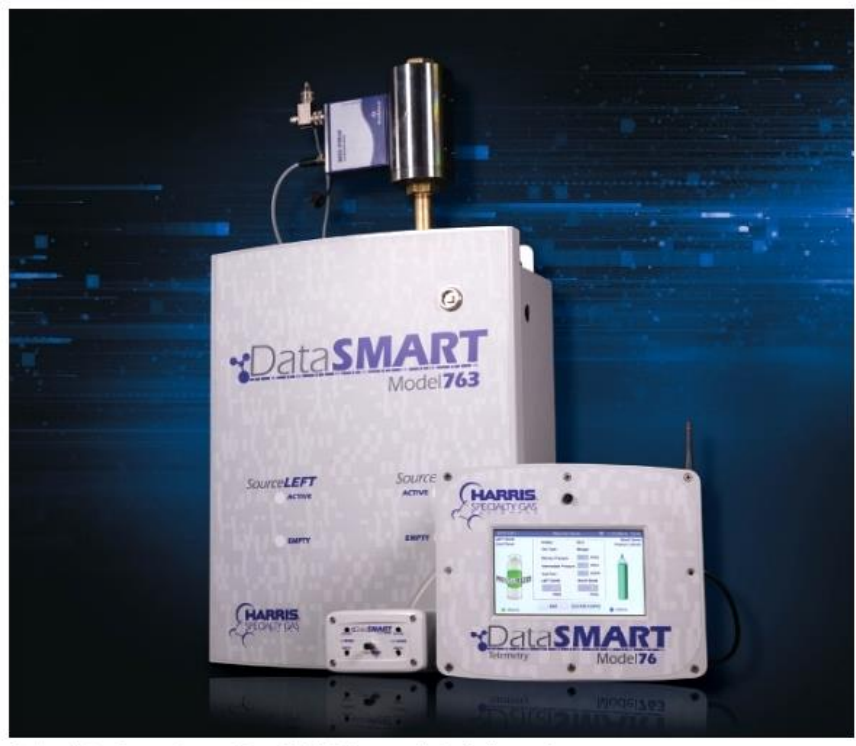
DataSMART Automatic Switchover System

DG: Harris made fighting the pandemic a top priority as we designed and produced critical medical gas regulators and systems to support the treatment of patients. For a time, we shifted all of our specialty gas resources to these efforts, as well our industrial efforts. There was no downtime for Harris during 2020, as we continued to serve our regular customers and also engaged in the engineering and product development of DataSMART™.