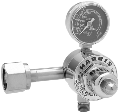
Medical Single-Stage Preset Regulator