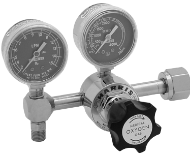
Medical Metering Regulator