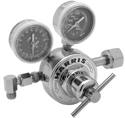
Medical Metering Regulator