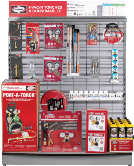
HVAC 4 FOOT