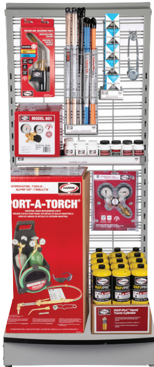
HVAC 2 FOOT