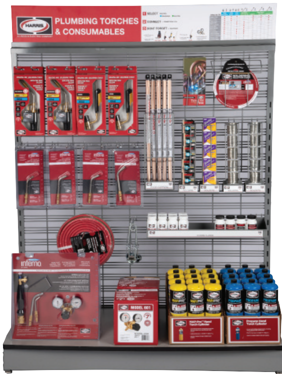
PLUMBING 4 FOOT