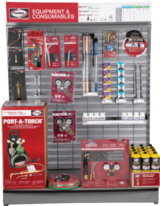
MIXED SET 4 FOOT