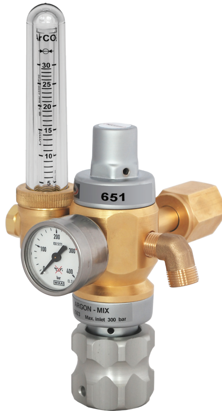
Model shown: 651-30L-AR