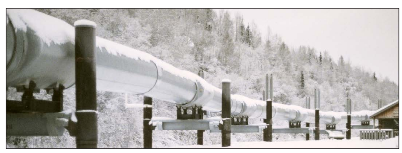
The 800 mile long 48 inch diameter Trans Alaska Pipeline System was constructed using Lincoln Electric Pipeliner® welders.