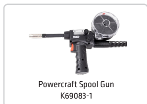
Powercraft Spool Gun K69083-1