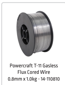
Powercraft T-11 Gasless Flux Cored Wire 0.8mm x 1.0kg - 14-110810