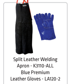
Split Leather Welding Apron - K3110-ALL Blue Premium Leather Gloves - LA120-2