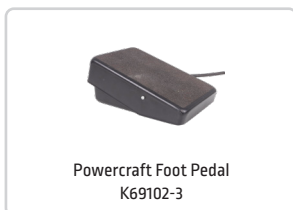
Powercraft Foot Pedal K69102-3