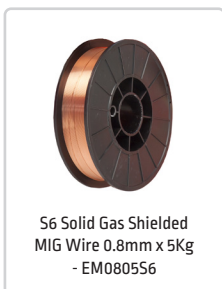
S6 Solid Gas Shielded MIG Wire 0.8mm x 5Kg - EM080556