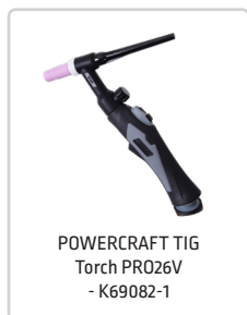
POWERCRAFT TIG Torch PRO26V - K69082-1