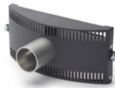
Hose Connection Outlet Order K2389-2