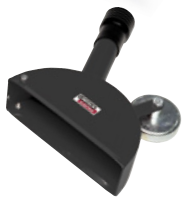
UNM Suction Nozzle for Heavy Smoke Order K639-6