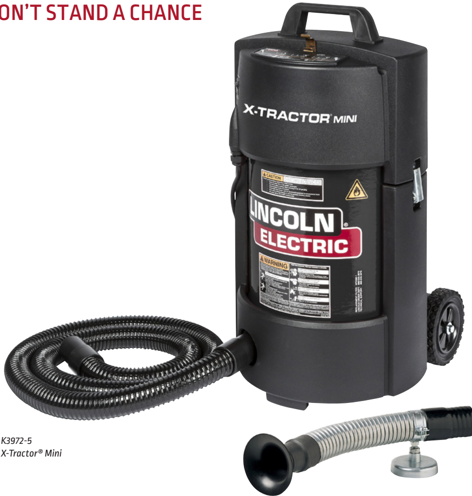
K3972-5 X-Tractor® Mini