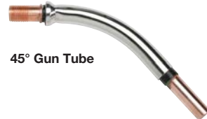
45° Gun Tube