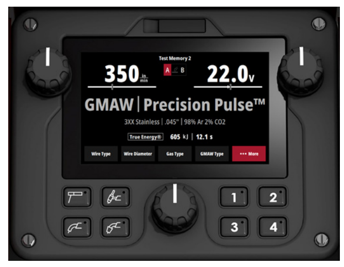
Power Wave 300C - Home Screen