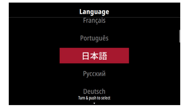
Power Wave 300C - language option screen