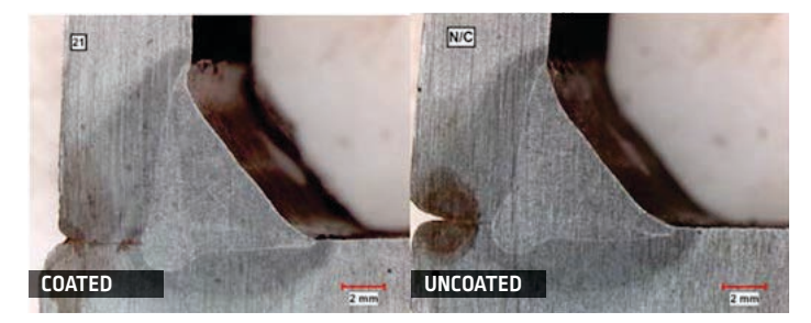
Micro-Etch testing shows no discernable weldment differences between uncoated \boldsymbol{\Theta} RP6 coated base material