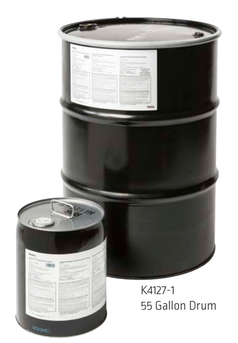
K4127-2 5 Gallon Pail

Refer to the Safety Data Sheet (SDS) for detailed health and safety information regarding RP6 Weldable Rust Preventative Fluid.