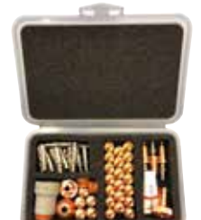
Wear part box for LC105