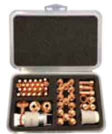
Wear part box for LC65