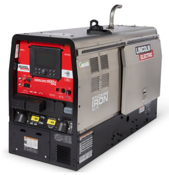
Frontier® 400X Pipe

CUSTOMER ASSISTANCE POLICY The Lincoln Electric Company is manufacturing and selling high quality welding equipment, consumables, and cutting equipment. Our challenge is to meet the needs of our customers and to exceed their expectations. On occasion, purchasers may ask Lincoln Electric for information or advice about their use of our products. Our employees respond to inquiries to the best of their ability based on information provided to them by the customers and the knowledge they may have concerning the application. Our employees, however, are not in a position to verify the information provided or to evaluate the engineering requirements for the particular weldment. Accordingly, Lincoln Electric does not warrant or guarantee or assume any liability with respect to such information or advice. Moreover, the provision of such information or advice does not create, expand, or alter any warranty on our products. Any express or implied warranty that might arise from the information or advice, including any implied warranty of merchantability or any warranty of fitness for any customers' particular purpose is specifically disclaimed.