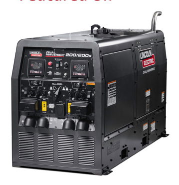
Dual Maverick® 200/200X