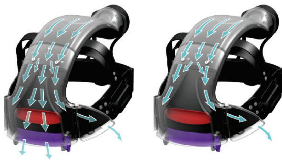
First baffle (Red) - controls ratio of air over forehead vs temples

Two air flow baffles allow users to adjust the air for maximum comfort and prevent drying of the eyes.