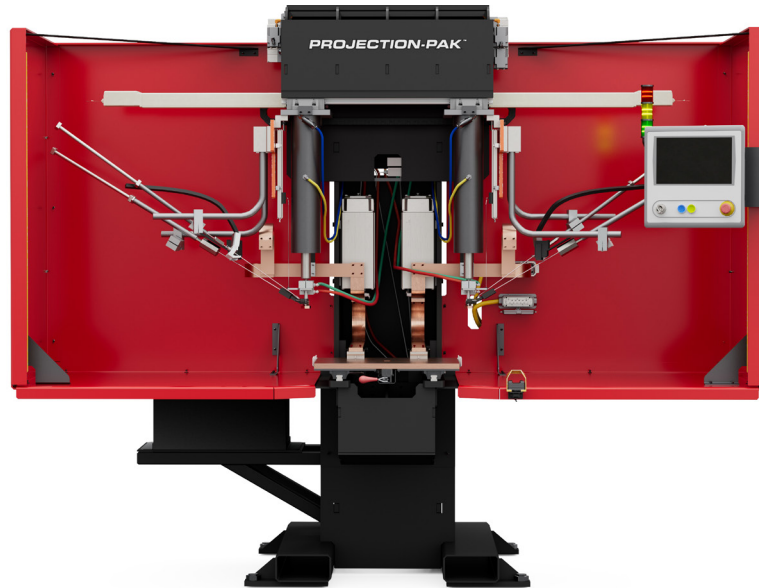
Dual Station Resistance Welder