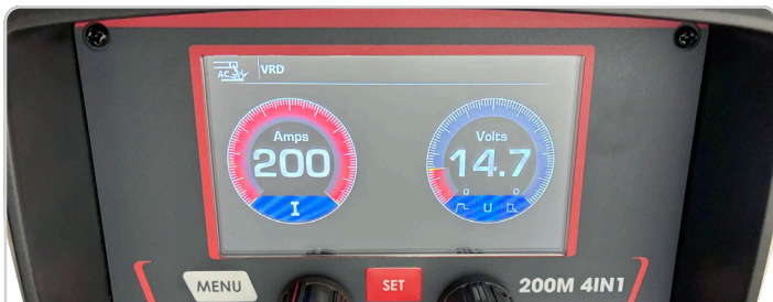
Stick AC [VRD]