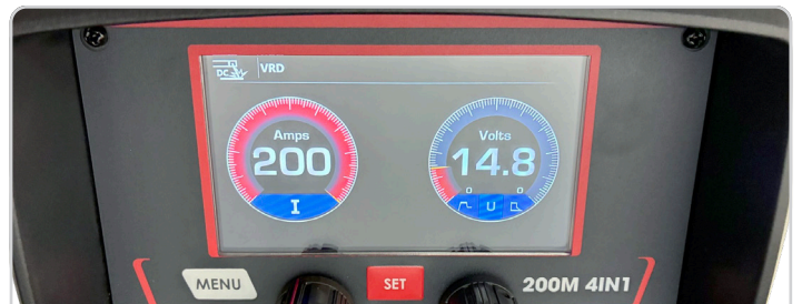
Stick DC [VRD]