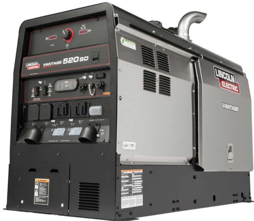
K4107-1 Air Vantage 520 SD Deutz T4F shown