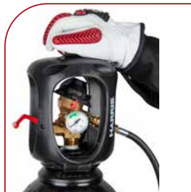
MINIMIZE SAFETY ISSUES