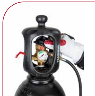
PRECISE PRESSURE / FLOW SETTING