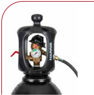
GAS LEVEL AT A GLANCE

Harris Products Group regulators are manufactured to perform in the most critical applications including our newest innovation: valve integrated pressure regulators.