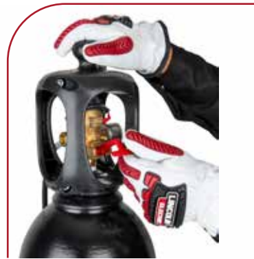
FAST OFF / ON / OFF CONTROL