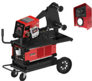
[K5440-1] Power Feed 84- Single Cool Arc 55S

* KP44332-15 ft liner will be needed for .045 HyperFill applications.