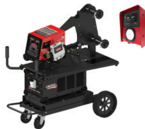
[K5440-3] Power Feed 84- Single Cool Wave 20S