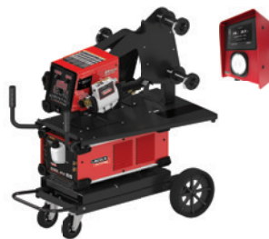
[K5440-2] Power Feed 84- Dual Cool Arc 55S