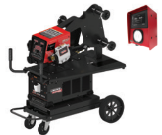
[K5440-4] Power Feed 84-Dual Cool Wave 20S

Not shown in image, Magnum PRO Water Cooled Gun