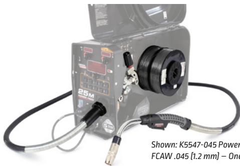
Shown: K5547-045 Power Feed 25M HyperFill FCAW .045 (1.2 mm) – One-Pak