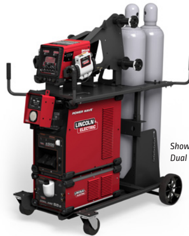
Shown: K4650-6 HyperFill - Dual Feeder Ready-Pak, Dual Cylinder Cart