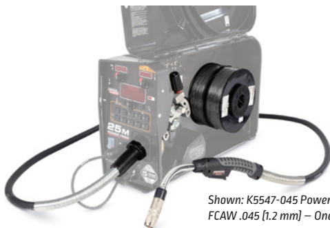
Shown: K5547-045 Power Feed 25M HyperFill FCAW .045 (1.2 mm) – One-Pak