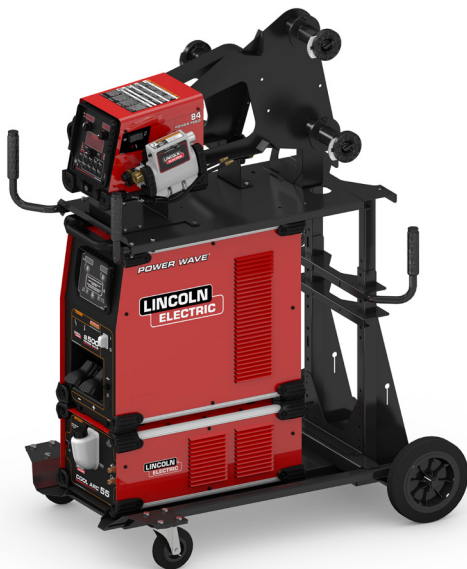
Shown: K4650-1 HyperFill - Dual Feeder Ready-Pak