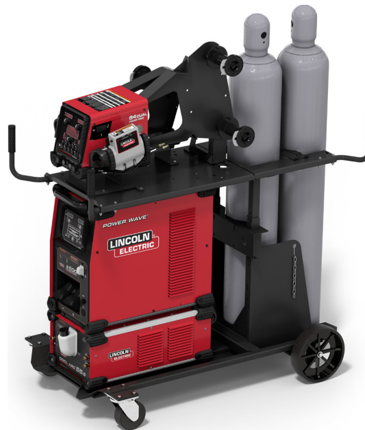
Shown: K4650-3 HyperFill - Dual Feeder Ready-Pak, Dual Cylinder Cart