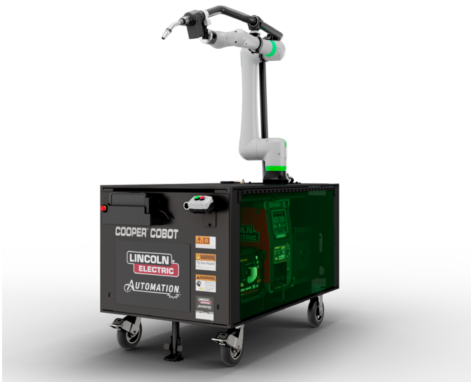
Cooper CRX-10iA/L Aluminum Welding Cobot Cart