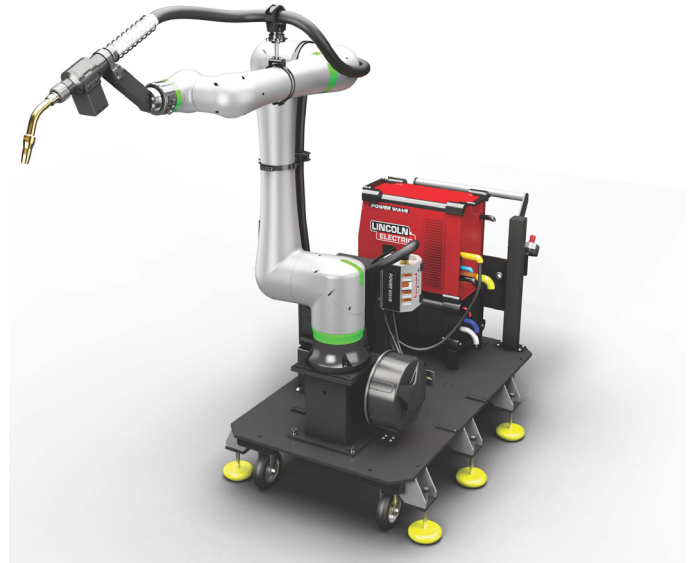
Cooper CRX-30iA/L Aluminum Welding Cobot Cart