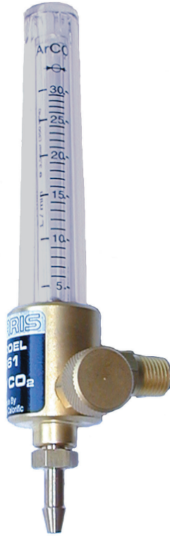
Model shown: 861 90° inlet & knob