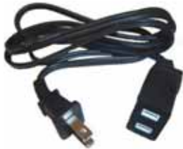
S29558-2 AC Extension Cord

The red CHARGING light will come on indicating the unit is being charged. When the green CHARGED light comes on, the battery is charged. This can take a day or longer depending on the battery's state of charge.