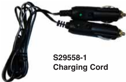
S29558-1 Charging Cord

You can charge the Jump Starter using the 12Vdc charging cord. Plug one end of the cord into the 12V socket on the front of the Jump Starter, then plug the other end into the vehicle's auxiliary power port while the vehicle is running. Note that you do not want to charge for more than 15 minutes as the current available from a vehicle can damage the Jump Starter's battery if left in for more than 15 minutes