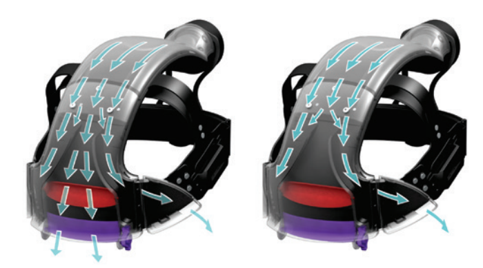
First baffle (Red) - controls ratio of air over forehead vs temples

Two air flow baffles allow users to adjust the air for maximum comfort and prevent drying of the eyes.